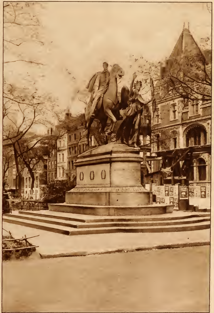
STATUE OF GENERAL SHERMAN. This handsome memorial to William Tecumseh Sherman is situated at Fifth Avenue and 59th Street.